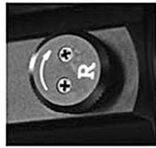
Target Turret Windage and elevation knobs

NOTE: Keep the dot you are shooting with in the center of scope when in use.