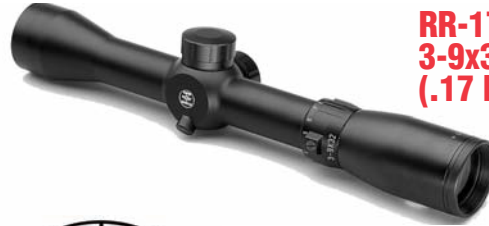
RR-17 HMR 3-9x32mm (.17 HMR)