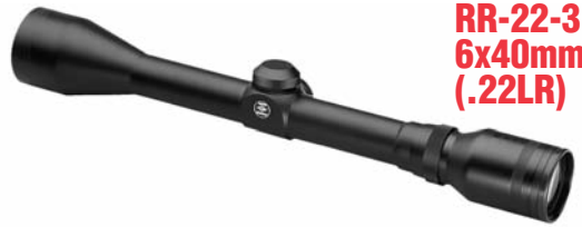
RR-22-3 6x40mm (.22LR)