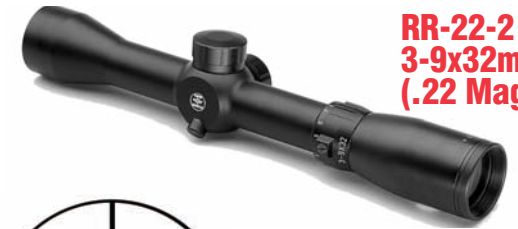
RR-22-2 3-9x32mm (.22 Magnum)